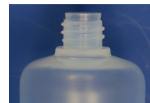
Standard Adapters for Lab bottle closures