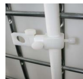
Probe with fixture