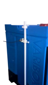
Promens Varibox FC 1000