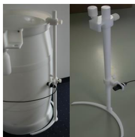
Base for plastic drum 200 litre