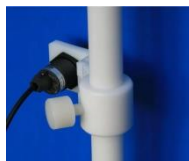
The sensor is suitable for coloured walls also.

Additional fixture types for IBC containers in development.